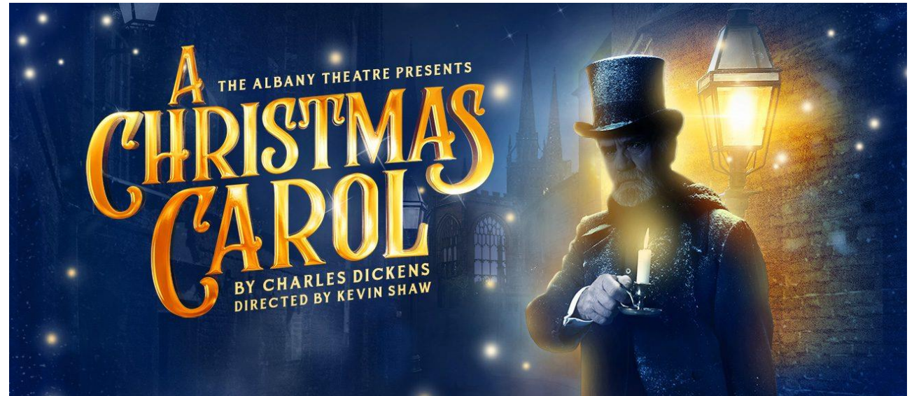
A Christmas Carol

In English Literature, you are tested on your understanding of a series of novels, plays and poems.